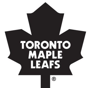
Toronto Maple Leafs