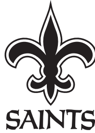
New Orleans Saints